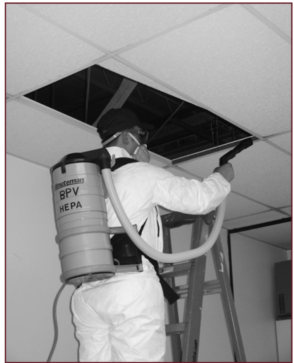
Minuteman's H.E.P.A. Back Pack Vacuum is lightweight and versatile, it can go virtually anywhere. Shown with optional dust brush.