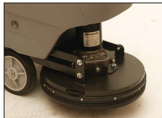
Low brush deck is ideal for cleaning underneath obstacles.