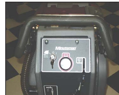
Simplified and easy-to-understand operator controls.