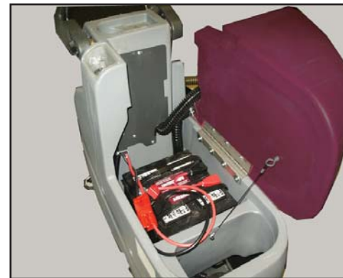
Easy access to the batteries and drive system for service and maintenance.