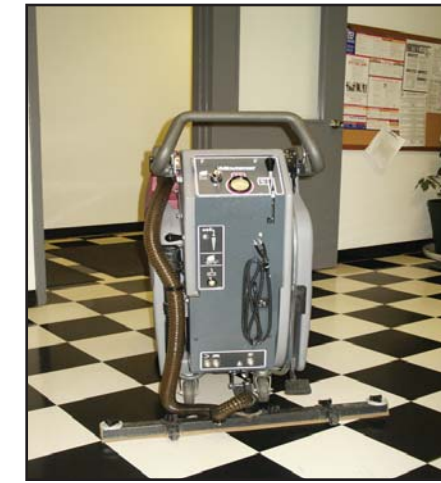
Squeegee with no adjustments necessary and a two sided blade